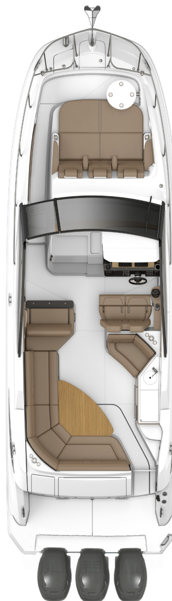
DECK / COCKPIT LAYOUT (Shown w/ Options)

NOTE: Some features and options may not be available when a boat is built for regions outside North America and/ or has CE Certification. Boats ordered with 220V/50 cycle electrical systems will have the appropriate appliances in the corresponding voltage.